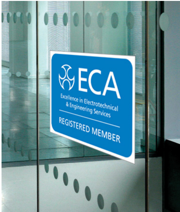
ECA Window Sticker white on blue