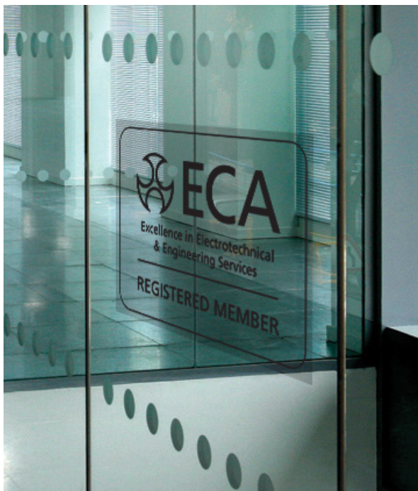
ECA Window Sticker black transparent