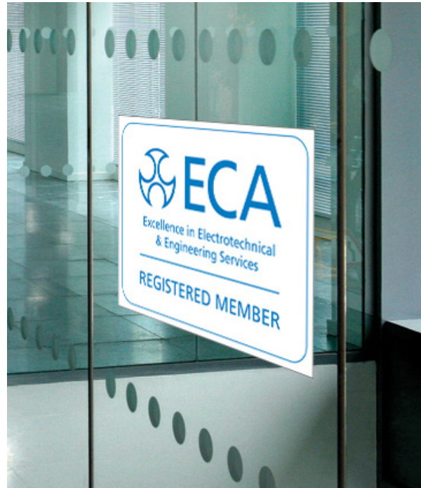
ECA Window Sticker blue on white